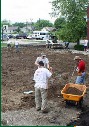
Helping the Shepherd Community Center build a playspace at the Jireh building

“The opposite of gratitude is taking things for granted”