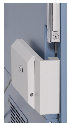
Undercounter Adapter (Shown with Omnicell® FlexLock)